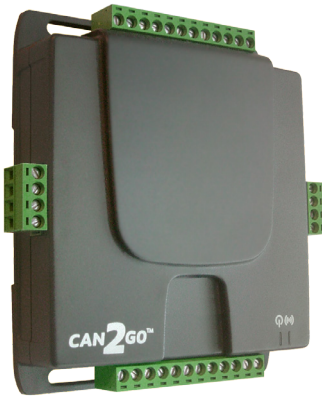
BACnet, EnOcean and ZigBee. Controller, gateway and BACnet IP server. All in one device.