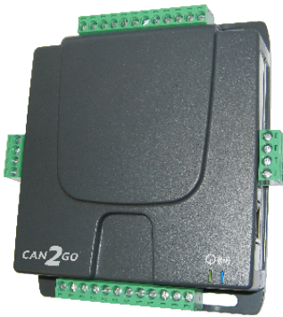
UN2 - Universal controller