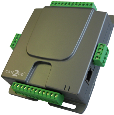
BACnet, EnOcean and ZigBee. Controller, gateway and BACnet IP server. All in one device.